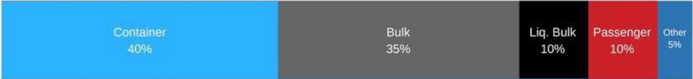
Certified Port Executive Alumni by Cargo Type

Certified Port Executive Alumni represent the full spectrum of cargo types