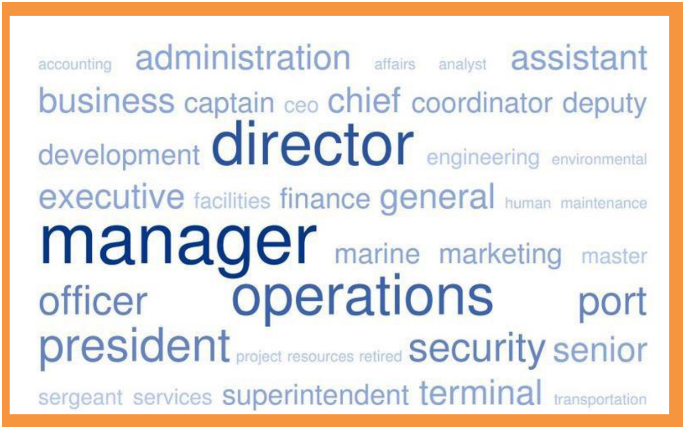
Most common job titles of Certified Port Executive Alumni